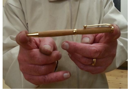
These pens can sell for between £7.50 and £10